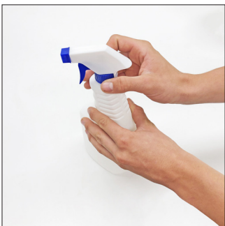
1. Remove nozzle.