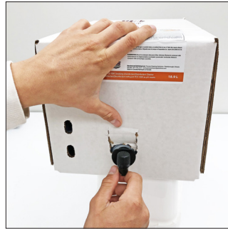
3. Secure Spout.