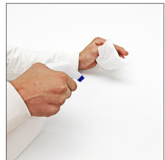
4. Saturate wipe or surface. Remove with dry wipe or allow to dry.