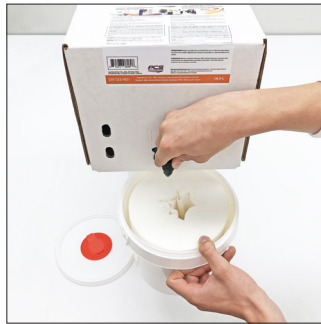
5. Pour liquid over wipes. (Recommended 1 - 1.5L)