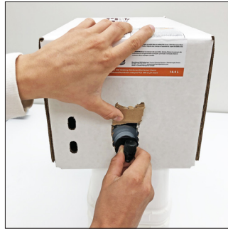
2. Reveal Spout.