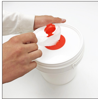
5. Thread first wipe.