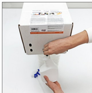
2. Fill Container with liquid.