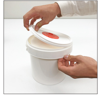
4. Remove Lid.