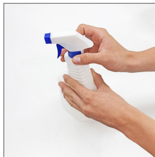
3. Replace nozzle.